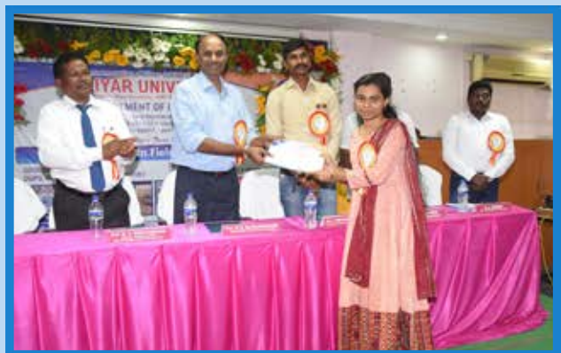
The Department of Geology organized a three day Workshop cum Field Training including Geological Mapping and Drone Survey on 19-21 September 2022.