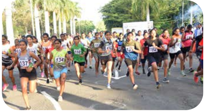
The Cross Country race for men and women of affiliated colleges of Periyar University was conducted on 15.09.2022 for all India tournament. The Vice Chancellor flagged off the selection race.