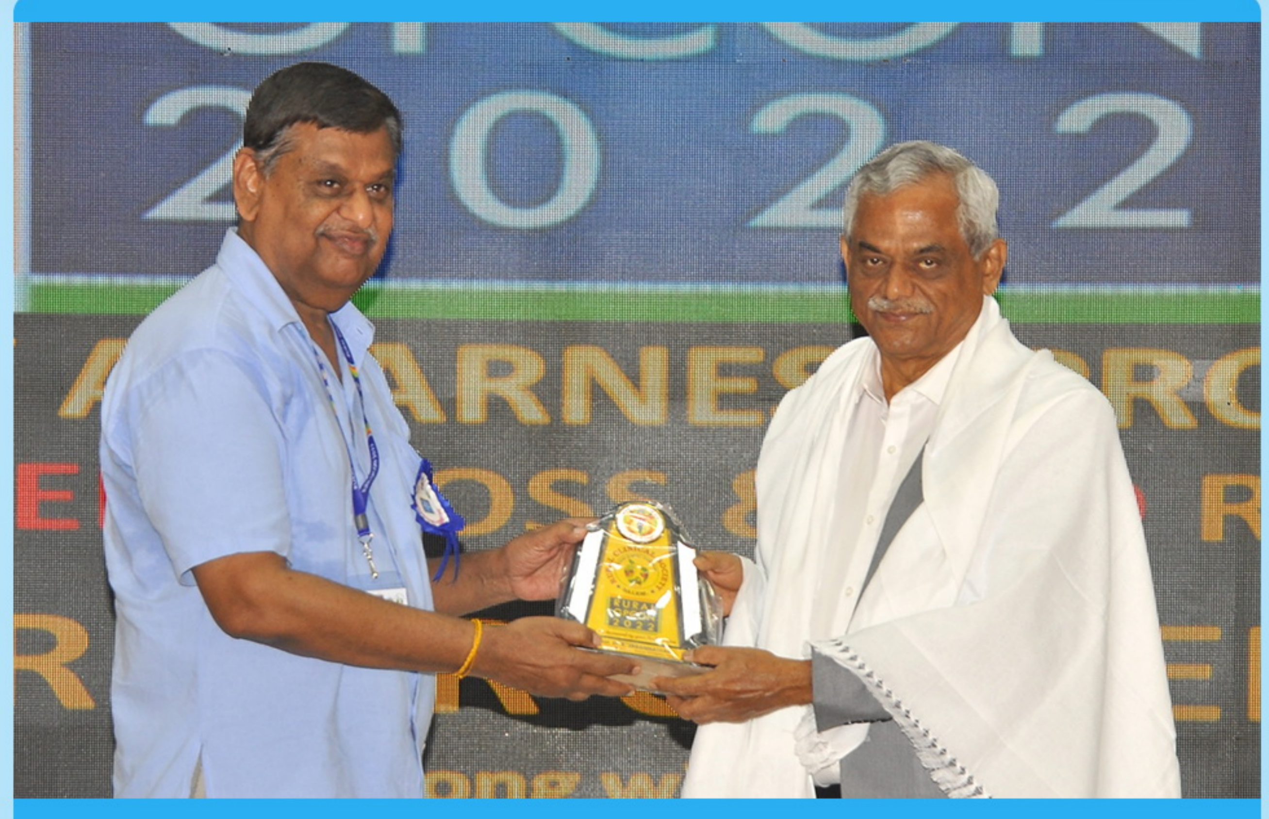
The Youth Red Cross and Red Ribbon Club of Periyar University conducted a One day Awareness program for YRC /RRC Program Officers and Rural Doctors on 13.11.2022 in association with Rural Clinial Society and Thulasi Diabetic Foundation.