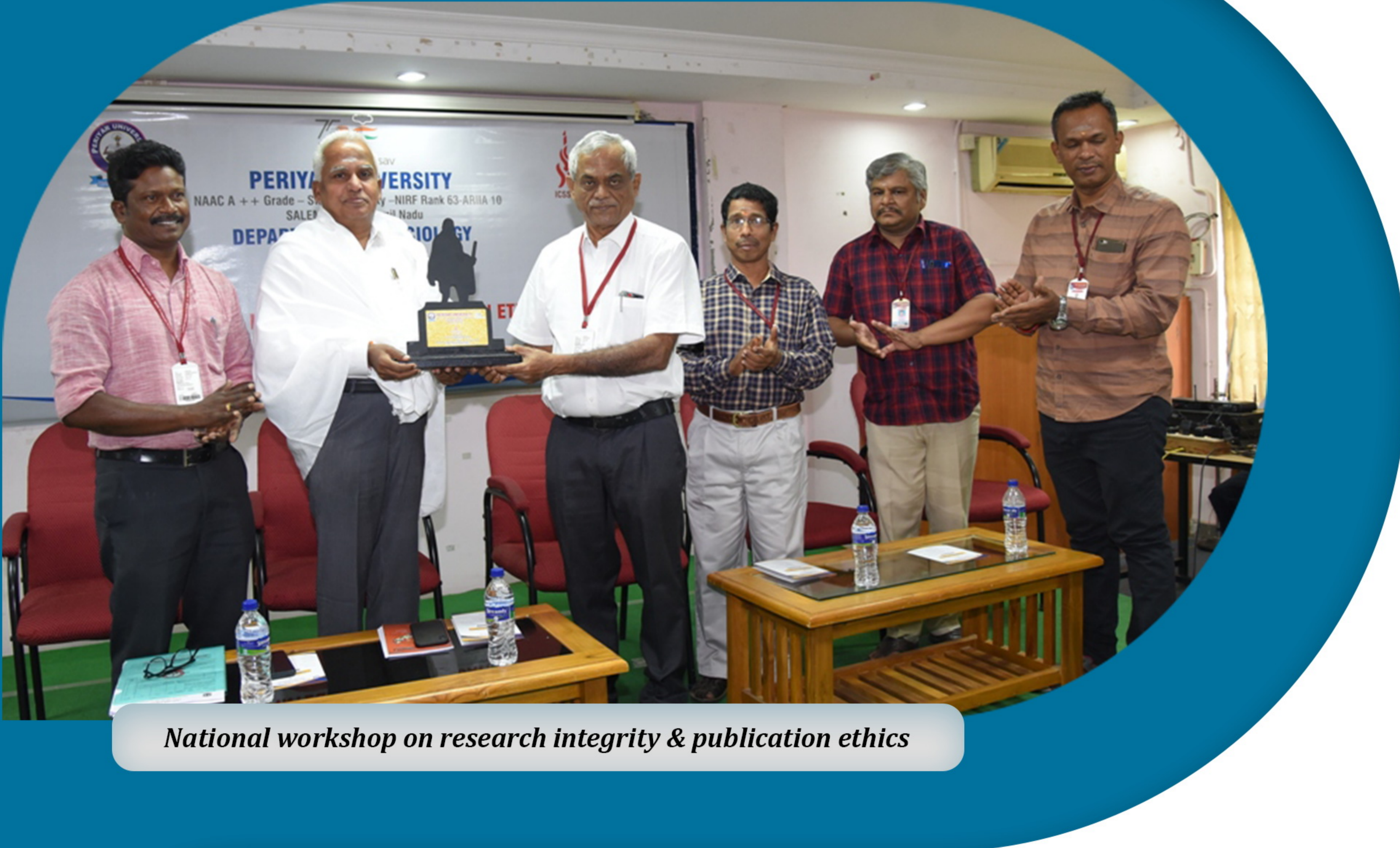
National workshop on research integrity & publication ethics

NAAC A++ Grade-State University - NIRF Rank 63 - ARIIA Rank 10 SALEM - 636 011, TAMIL NADU