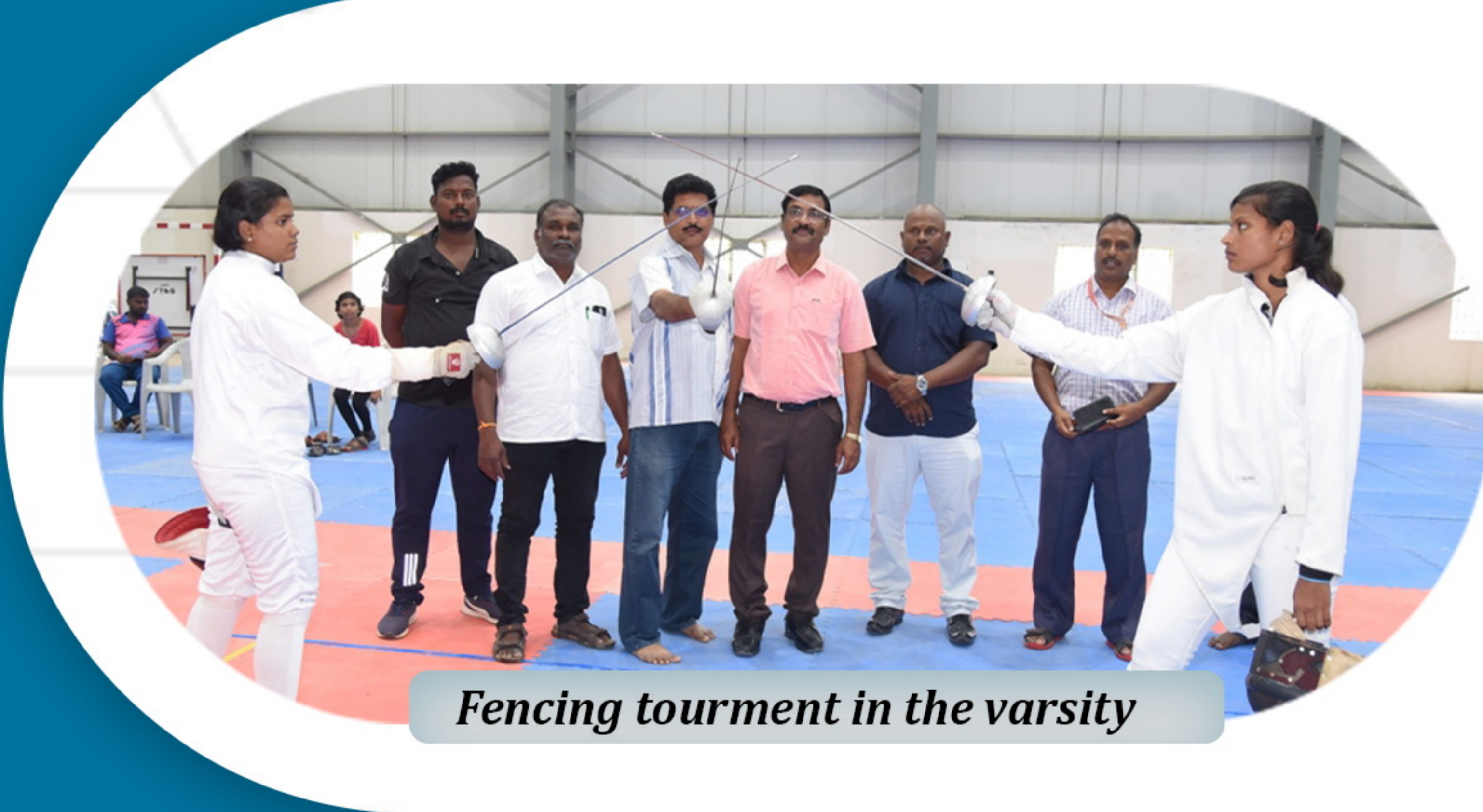
Fencing tournament in the varsity