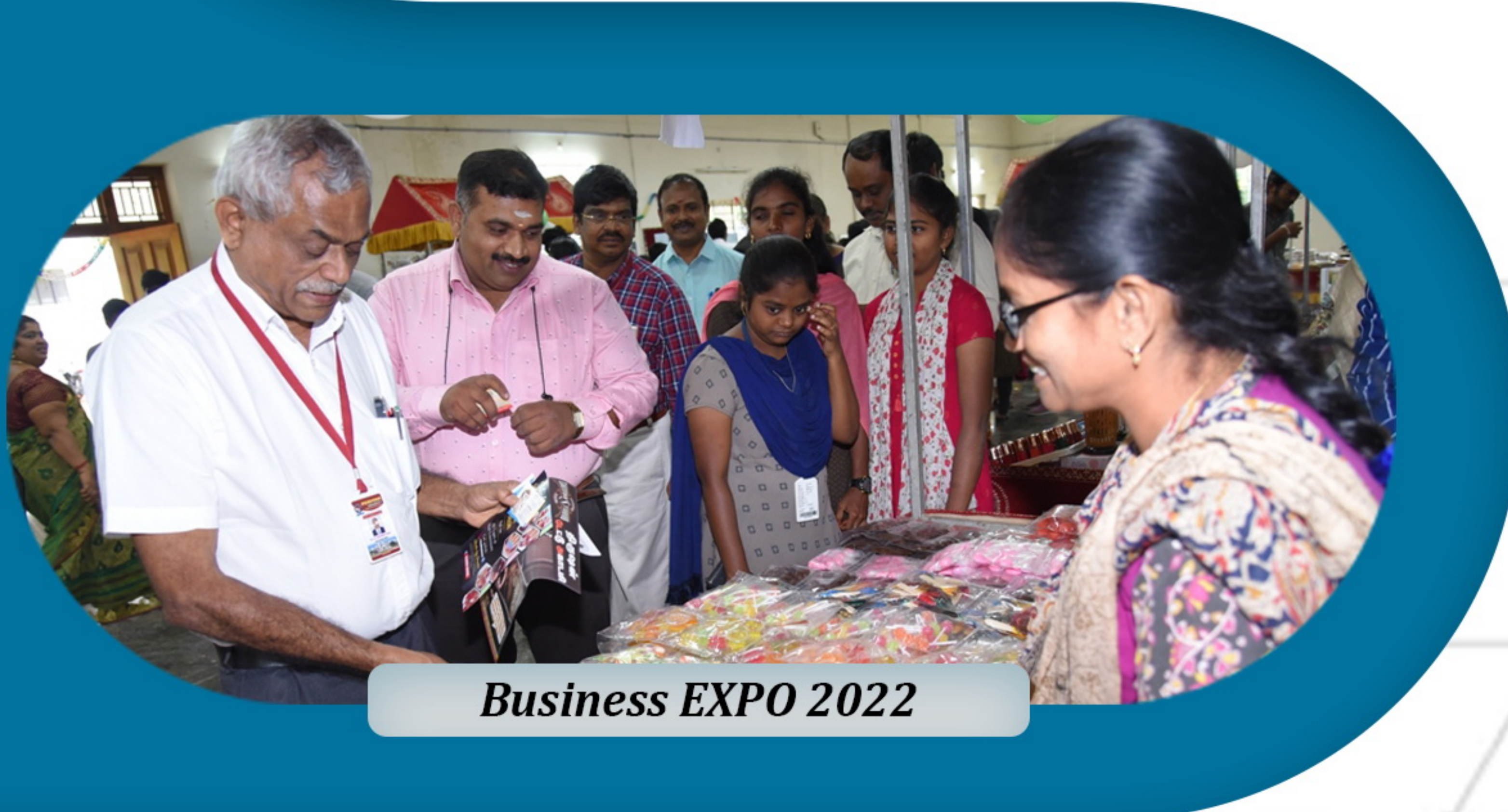
Business EXPO 2022